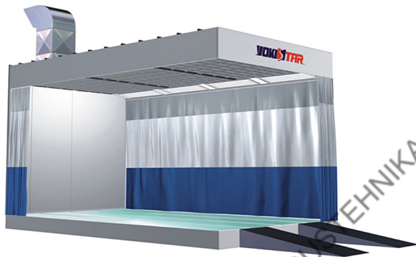
YS-300-B 技术参数表 Technical Parameters for Prep Station YS-300-B