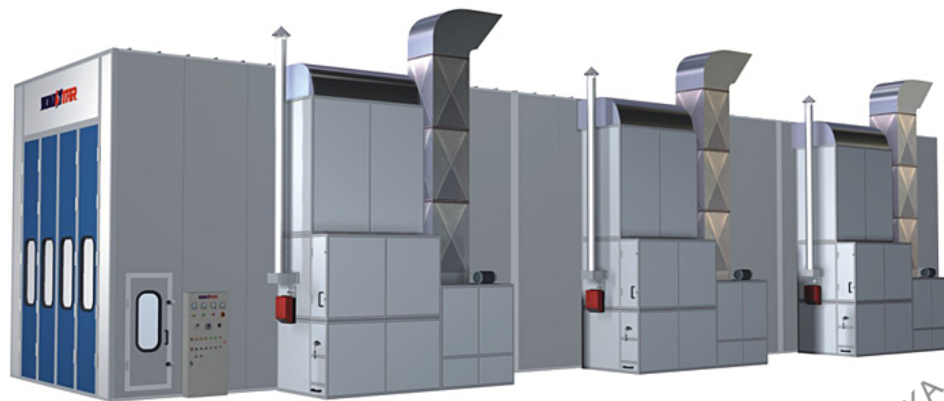
YS-23-50 技术参数表 Technical Parameters for Spray Booth YS-23-50